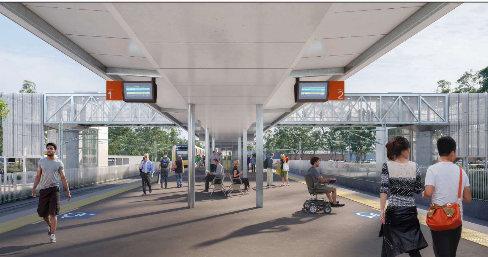
Artist impression of new Kingston station, subject to change.