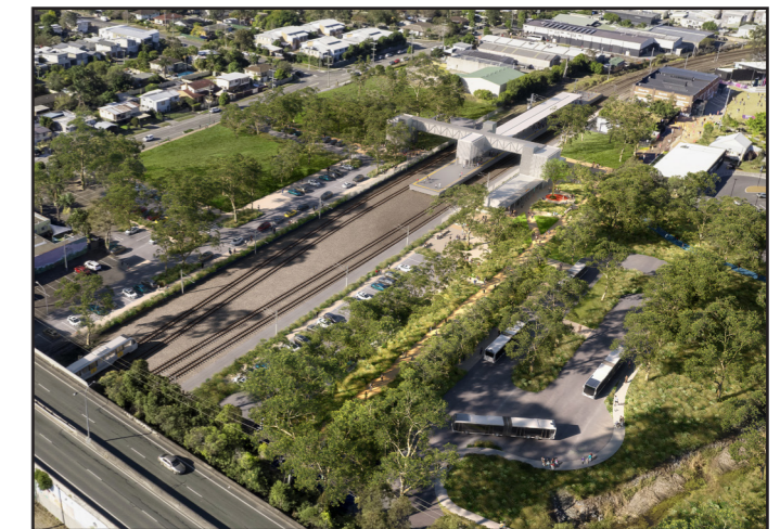
Artist impression of new Kingston station, subject to change.